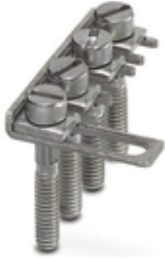
Switching jumper, pitch: 8.2 mm, number of positions: 4, color: silver

Please be informed that the data shown in this PDF Document is generated from our Online Catalog. Please find the complete data in the user's documentation. Our General Terms of Use for Downloads are valid ( http://phoenixcontact.com/download )